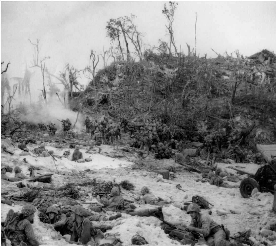
1st Marine Division on White Beach near “The Point”