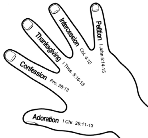
Prayer Hand Illustration Five Kinds of Prayer

But prayer is more than just important; it is a matter of life or death as far as spiritual growth is concerned. As you don't really get to know your Father till you let Him speak to you through His Word, so the father-child relationship cannot deepen unless you converse with Him, and share your problems, your burdens, your worries, and your joys. Children often complain that their parents never listen to them. Well, you'll never have that problem with your heavenly Father - He wants you to talk to Him.